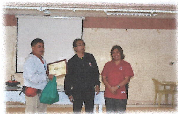
Awarding of Certificate and giving of token to our Guest Speaker