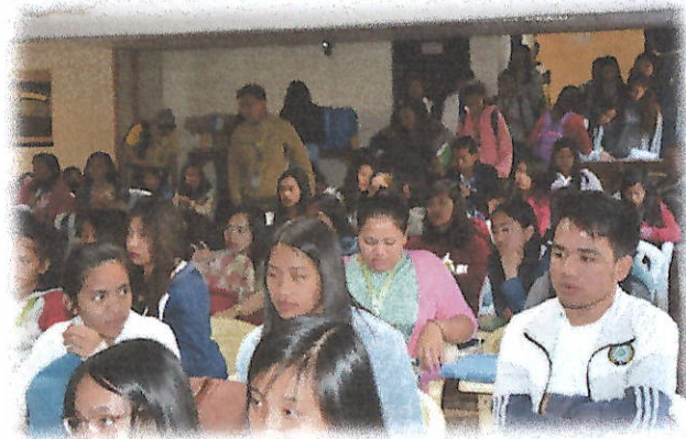
Participants during the Seminar held at CAS Little Theater