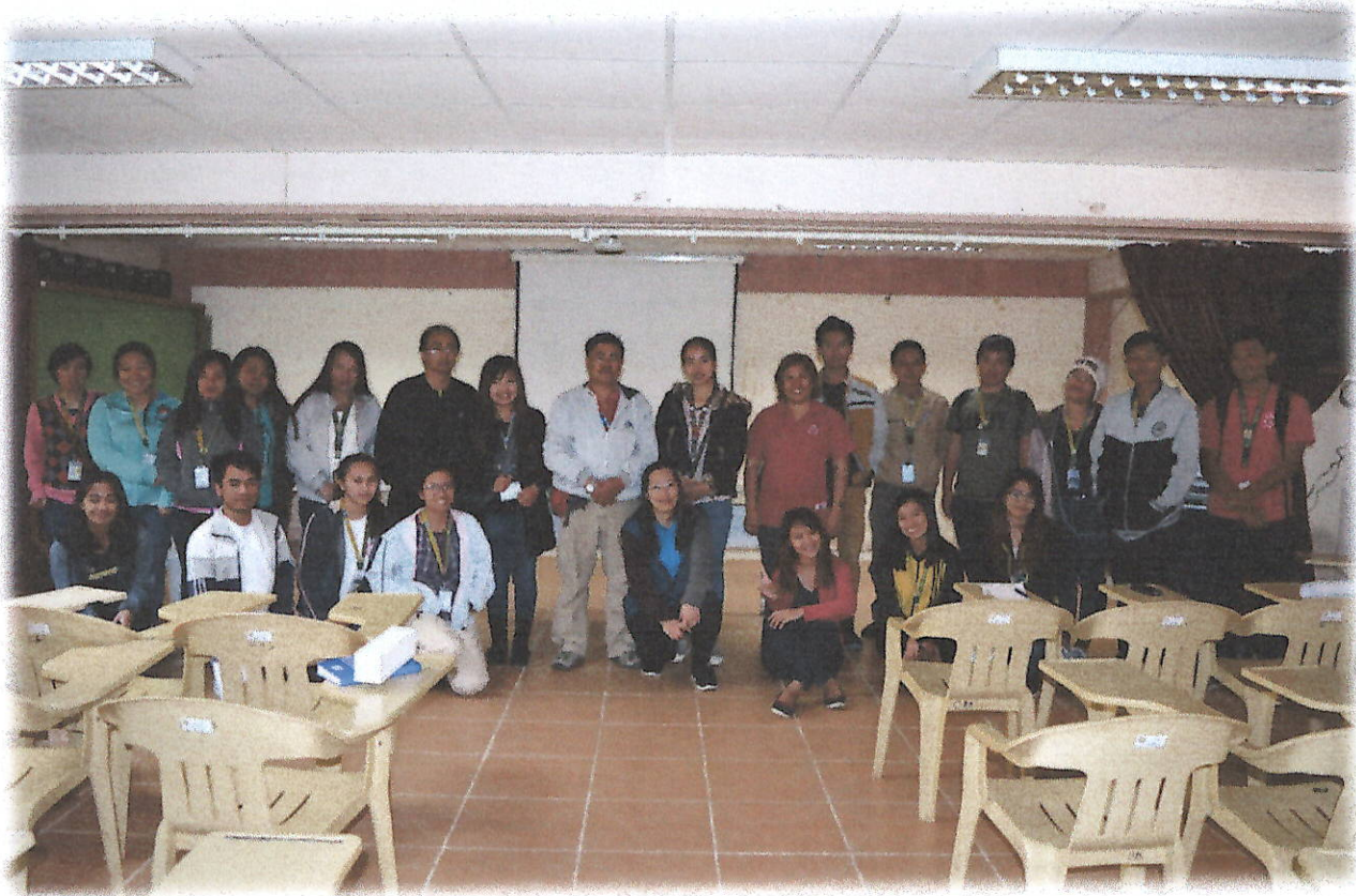
Group Picture Taking of Participants with the Guest Speaker and Biology Faculty