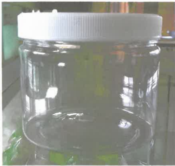
ITEM # 4