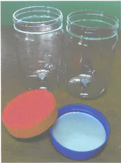
ITEM 1 and 2