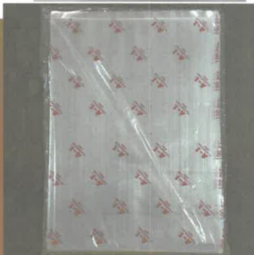
ITEM # 7