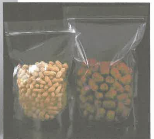
ITEM # 6