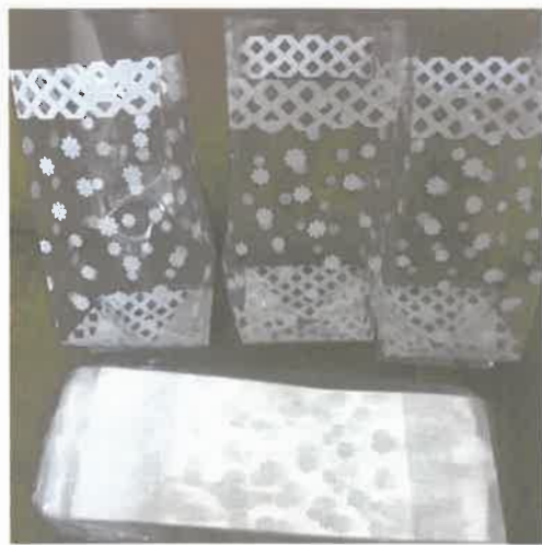
ITEM # 5