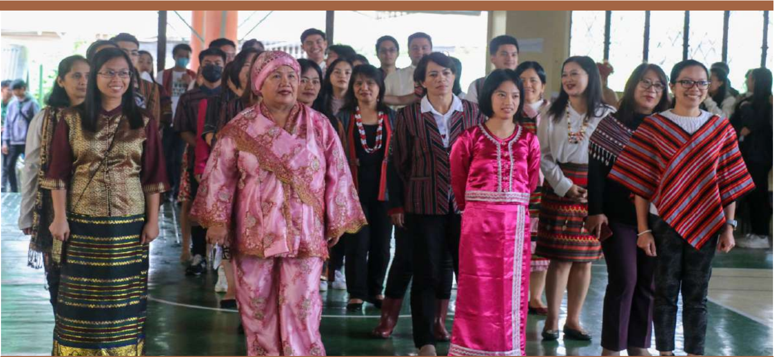
Nakiisa ang Unibersidad sa pagdiriwang ng Buwan ng Wika sa pamamagitan ng mga aktibidad na dinaluhan ng mga studyante, guro at mga opisyal ng BSU. Ang larawan ay kuha noong ika-31 ng Agosto habang ginaganap ang pampinid na palatuntunan ng Buwan ng Wika.