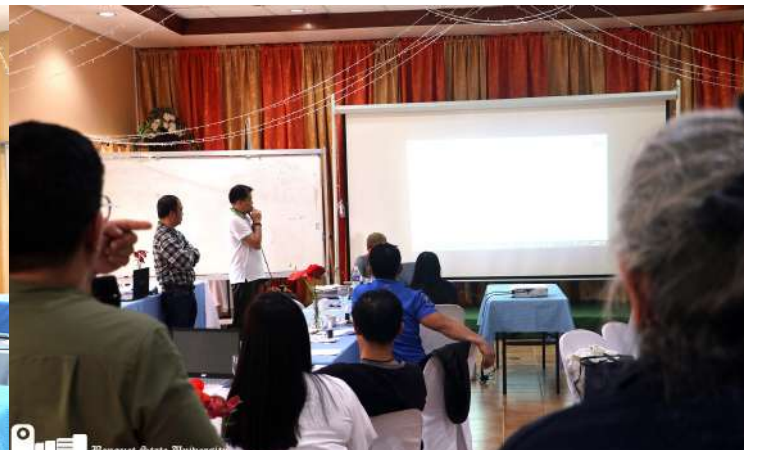
BSU officials, faculty members and staff discussed their plans with the invited consultants from CHED-CAR and NEDA-CAR on the establishment of a College of Medicine in BSU. The planning activity was held on August 10-11, 2023 at the Palm Grove Resort in Tuba, Benguet.

CAH, pinangunahan....from page 1 ng sanaysay, poster-islogan at pag-indak.