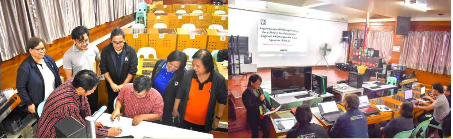
DOST-STII personnel with BSU officials, faculty and staff during the turn-over activity of the digitization devices at the BSU ICT hall on August 24, 2023 under the "Augmenting and Strengthening the e-Library Services in the Regional R&D Consortia Base Agencies" project.

The Department of Science and Technology-Science and Technology Information Institute (DOST-STII) deployed one scanner and one computer to Benguet State University through a project titled "Augmenting and Strengthening the e-Library Services in the Regional R&D Consortia Base Agencies" on August 24, 2023, at the BSU ICT Hall.