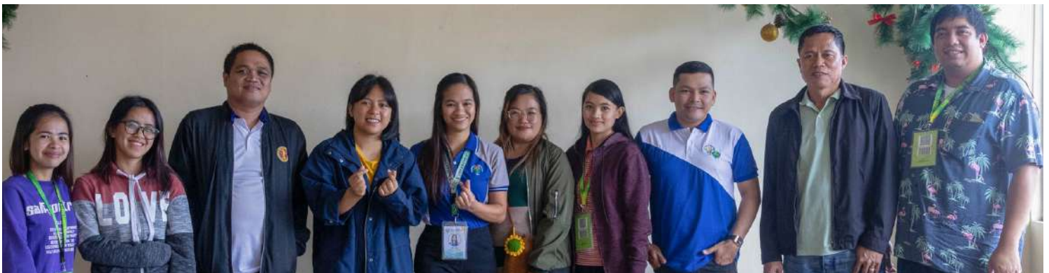
Department of Agriculture- Regional Field Office XII personnel with Benguet State University Agri-Based Technology Business Incubator/ Innovation Center (ATBI/IC) after discussion on ATBI/IC's best practices. They also toured the university IGP programs.