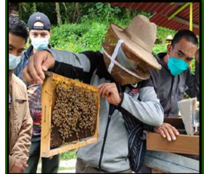
Beekeeping trainees learn beekeeping management during the series of hands-on trainings conducted by the Cordillera Regional Apiculture Center from January to May 2022.

Fifteen beekeeping trainees finished 320 hours of training on beekeeping management which started on January 17 and ended May 30, 2022. The training is part of BSU Cordillera Regional Apiculture Center (CRAC) internship and mentoring program.