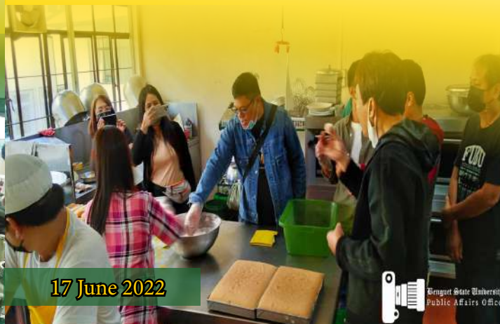
17 June 2022