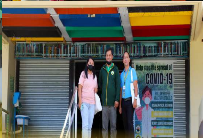
22 June 2022