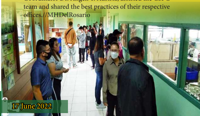
17 June 2022