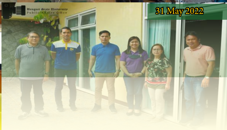
31 May 2022