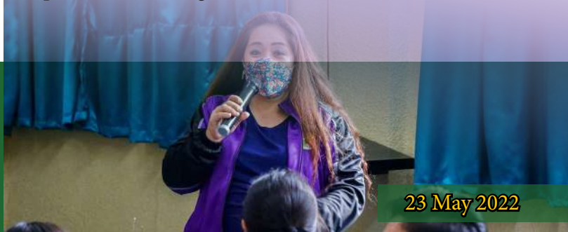
23 May 2022