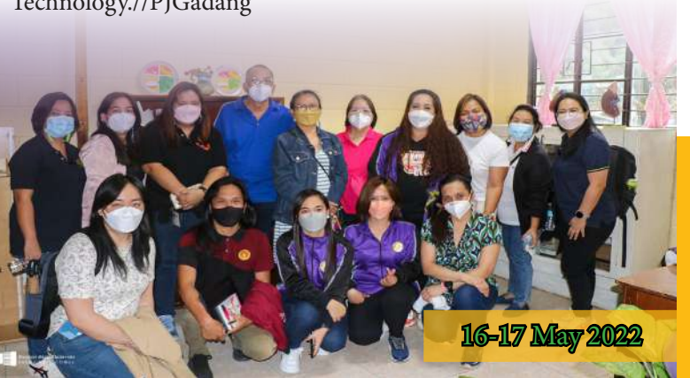
16-17 May 2022