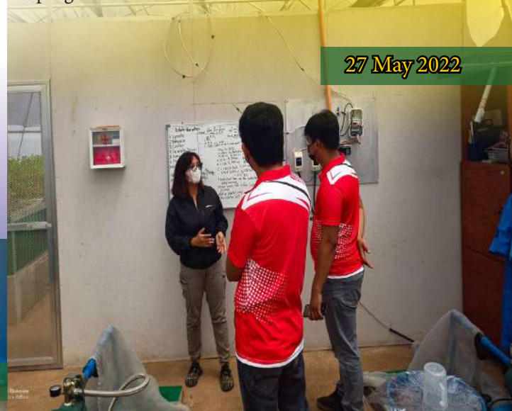
27 May 2022