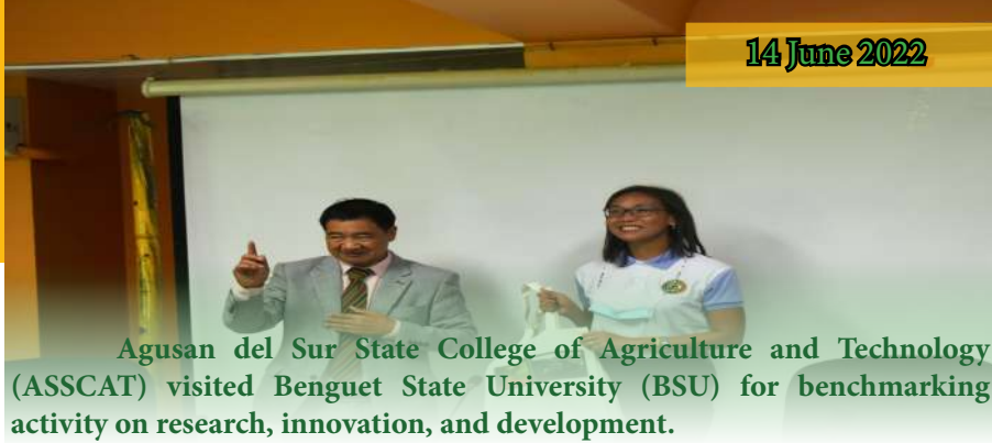
14 June 2022

Agusan del Sur State College of Agriculture and Technology (ASSCAT) visited Benguet State University (BSU) for benchmarking activity on research, innovation, and development.