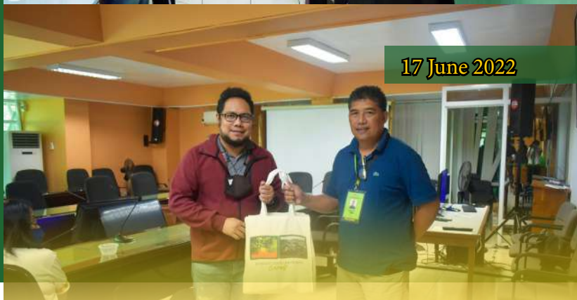
17 June 2022

Benguet State University welcomed Tarlac Agricultural University - Faculty Association for benchmarking activity. The benchmarking aims to collaborate with BSU Faculty Club Federation.