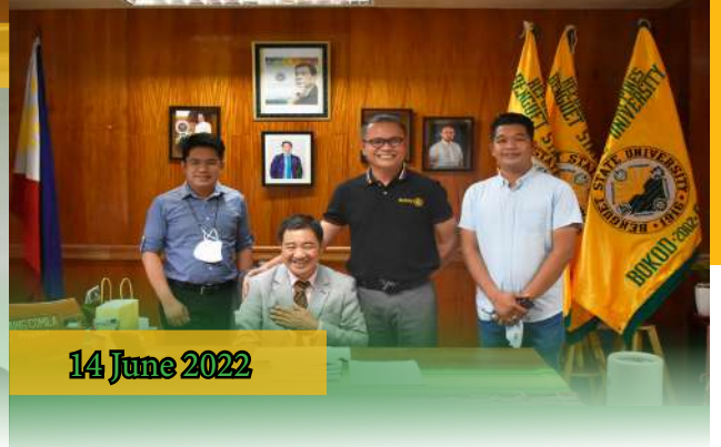
14 June 2022

After the group discussion, ASSCAT delegates toured Benguet State University's offices and facilities to further their learning activity.//OGDacocot