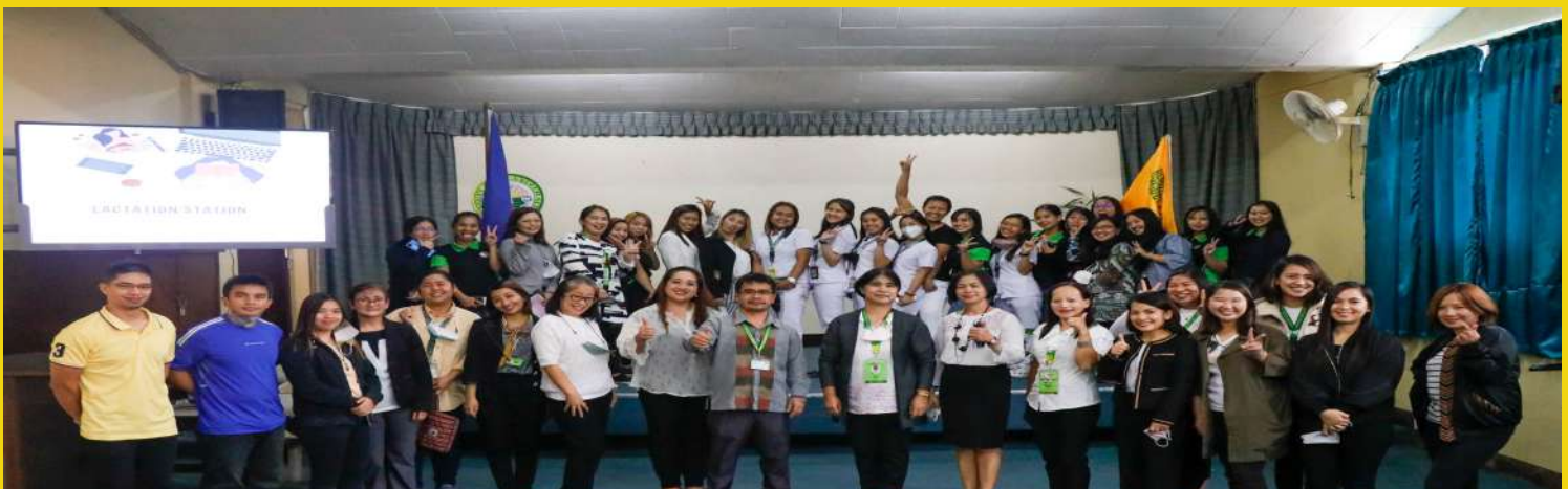
BSU-CHET through the support of the GAD Office opens lactation station on May 16, 2022 to accommodate lactating mothers. The lactation station is located at the first floor of the CHET building, RSDC Room 102.//AKCariño

The lactation station is located at the first floor of the CHET building, RSDC Room 102. The lactation station consists of a lavatory for hand washing, a refrigerator, table and chairs, comfortable seats for breastfeeding or expressing milk, electrical outlets, breast pumps, and breast milk bags. //AKCariño