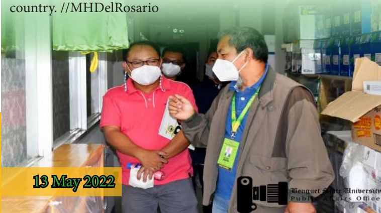
13 May 2022