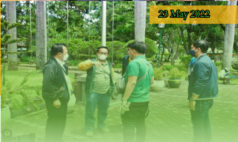
23 May 2022