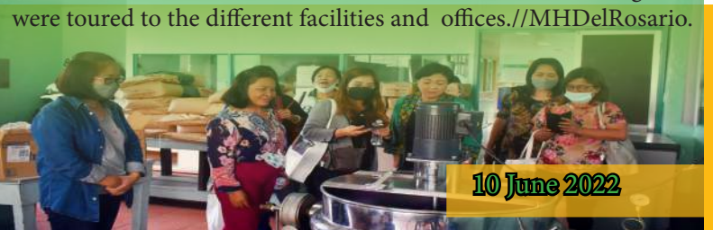
10 June 2022

After the conference at the RDC Hall, the NVSU guests were toured to the different facilities and offices.//MHDelRosario.