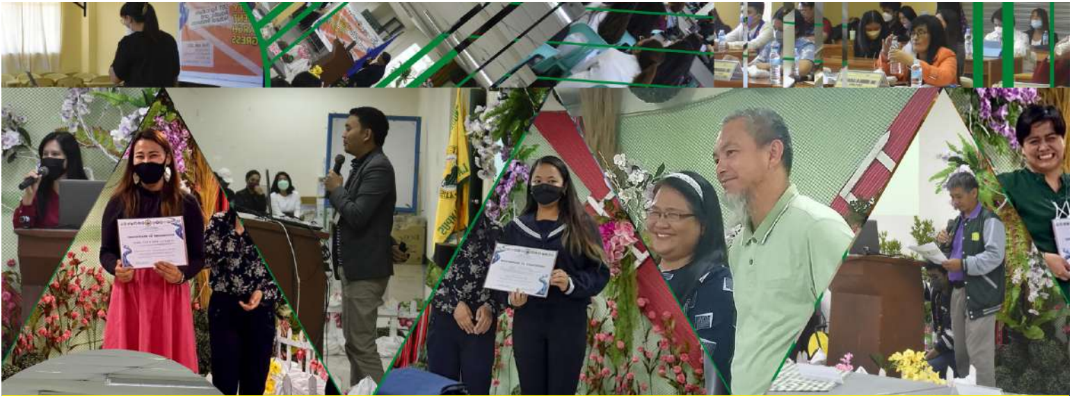
Highlights during 6th University Student Research Congress conducted on June 23-24, 2021.

Twenty-three student researches were recognized as winning papers during the 6th University Student Research Congress conducted on June 23-24, 2021. The 23 student research papers are among the 87 theses that competed during the event.