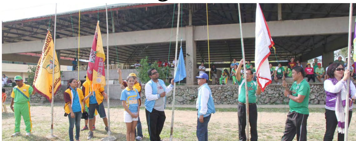
Representatives of the different members of the ASCU-SN prepare to hoist their school banners during the opening rites of the 2013 ASCU-SN Friendship Games on May 2, 2013.