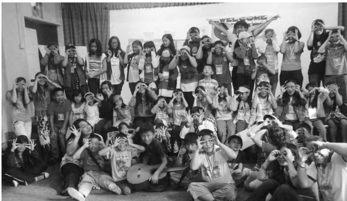
FROG POSE. The participants and organizers made a "nice frog's eyes" pose during the 'Save the Frogs: the BSU Mountain Collegian's (MC) Literary and Arts Workshop II' last April 27 at Strawberry Hall, Benguet State University. The activity is in line with the international celebration for the 'Save the Frog's day' in which MC pioneered the said environmental endeavour in the Philippines.