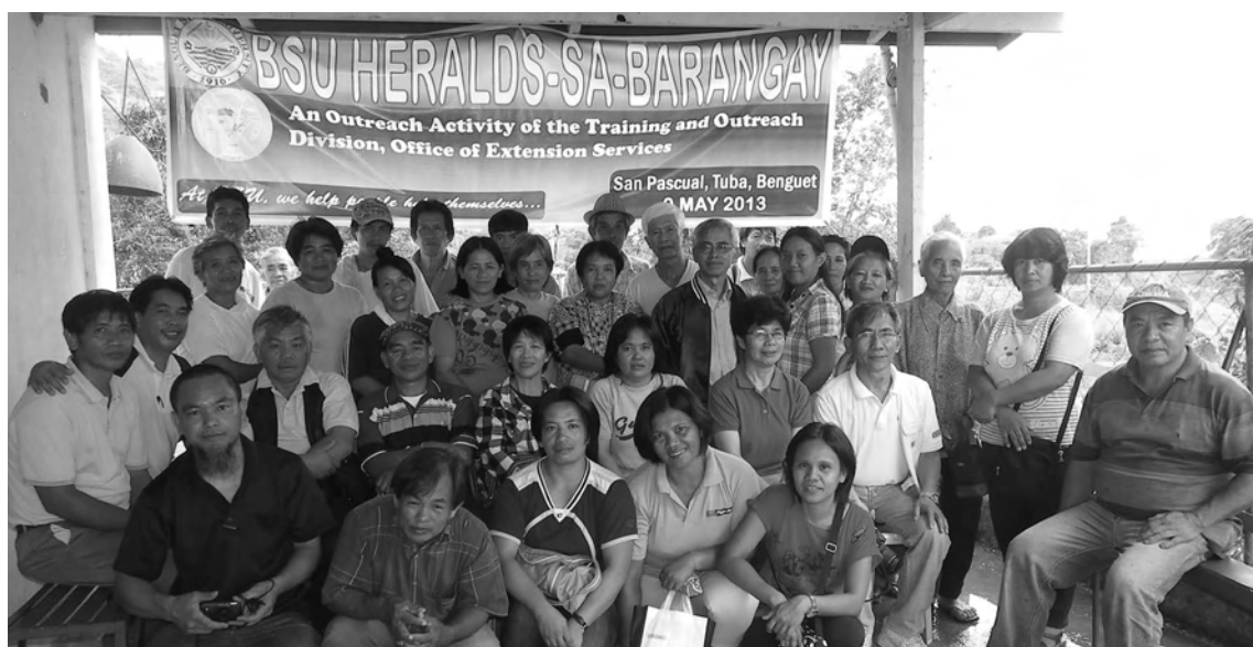
The BSU experts with the participants of the BSU-Heralds-Sa-Baranggay held on May 9, 2013 at San Pascual, Tuba, Benguet.//

"Dagita apan ag swimming dita ngato ket umay danto met ditoy ayan yo para kadagiti prutas yo," he said. San Pascual is located just after Nangalisan, a tourist destination known for its hot spring resorts.