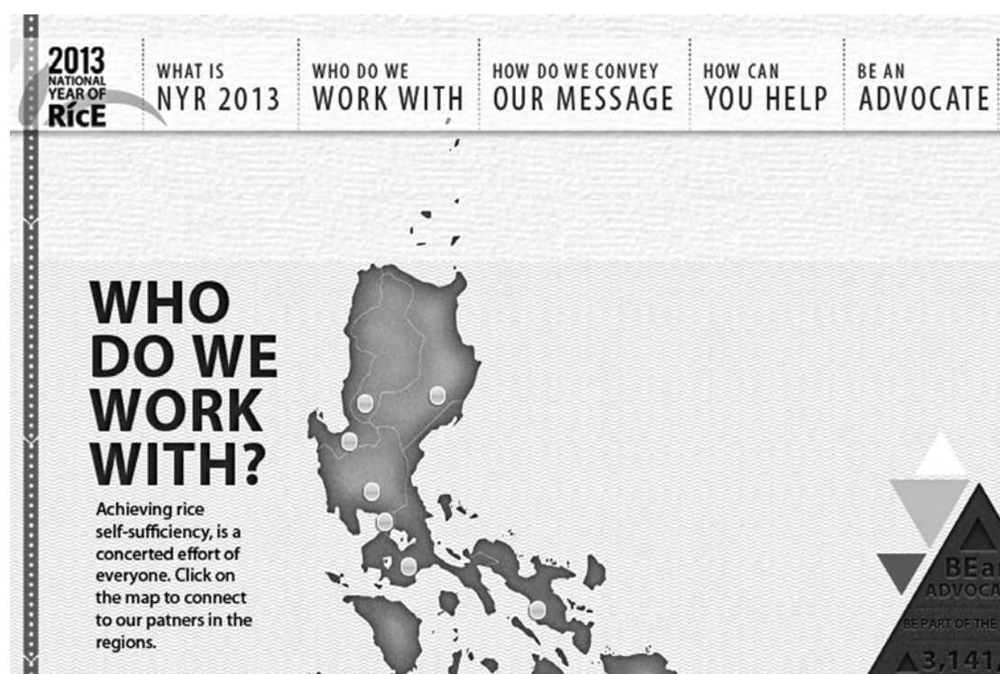
The NYR website.

6. If you plant rice, adopt recommended technologies. Higher yield means more rice to feed the country.