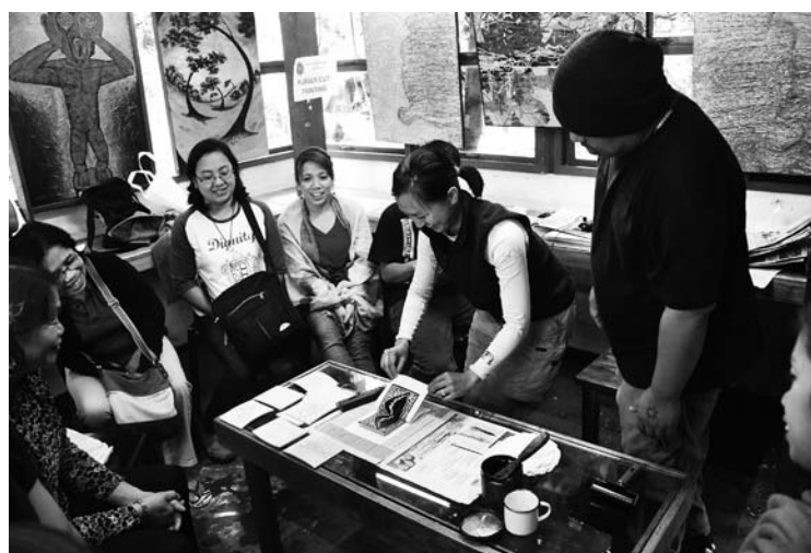
The author with other participants in a workshop during the 45th PAEA artploration.//