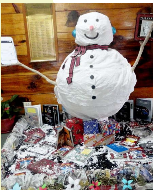
SETTING THE MOOD FOR BOOK CRAZE. Crafted by librarians to express that reading is a free gift, this snowman not only welcomes students and visitors to Benguet State University-University Library and Information Services but also encourages the patrons to read books in line with this year's celebration of the Library and Information Services Month and the National Book Week which ran from Nov. 24 – 30 with the theme "Libraries: Preservers and Promoters of Culture and Arts".