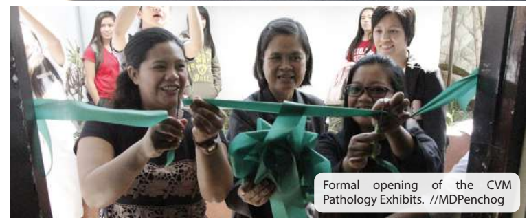
Formal opening of the CVM Pathology Exhibits.