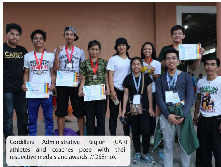
Cordillera Administrative Region (CAR) athletes and coaches pose with their respective medals and awards.