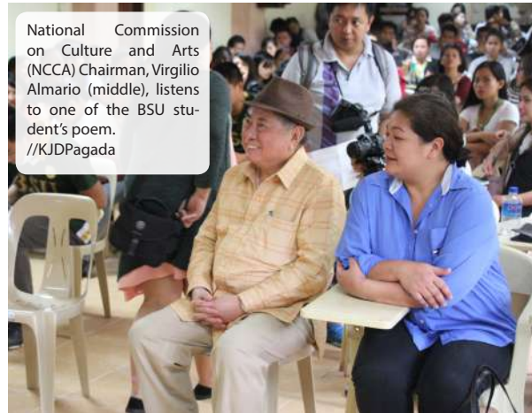
National Commission on Culture and Arts (NCCA) Chairman, Virgilio Almario (middle), listens to one of the BSU student's poem.