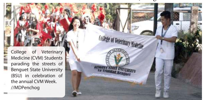
College of Veterinary Medicine (CVM) Students parading the streets of Benguet State University (BSU) in celebration of the annual CVM Week.

"So kung na-absorb ng fish ang chemicals, people will consume them as well (If the fish absorbs the harmful chemicals, they will