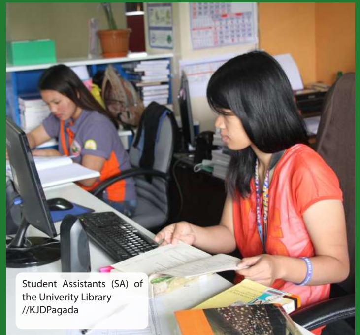
Student Assistants (SA) of the University Library