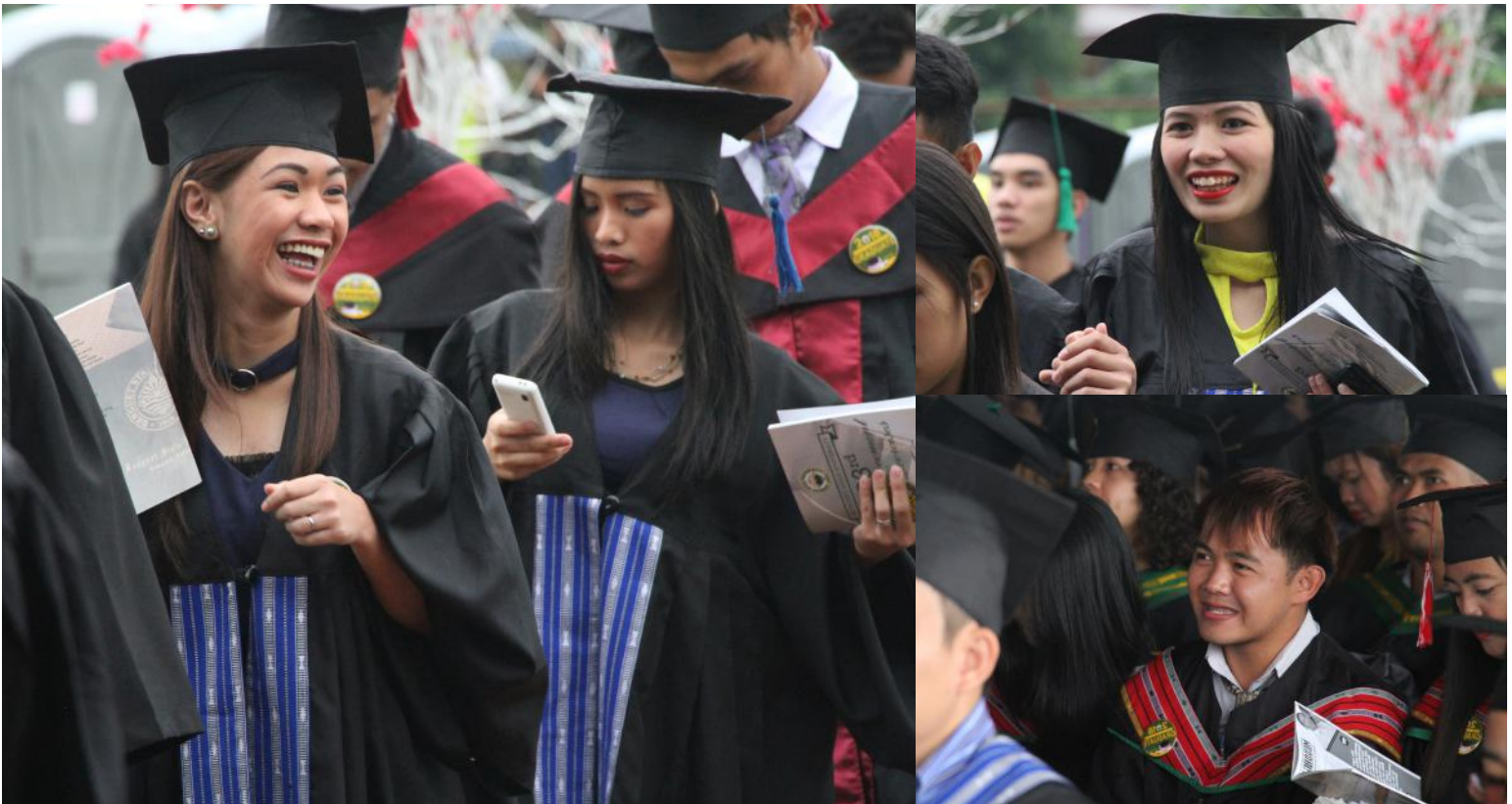
GRADUATE SMILE. BSU Graduates of different courses make their way to the commencement grounds as they ready their tassles awaiting their turn to go up the stage to receive their diplomas. //KJDPagada