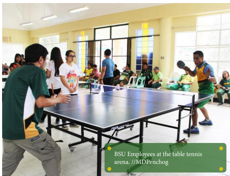
● BSU Employees at the table tennis arena. //MDPenchog