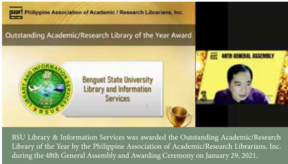
BSU Library & Information Services was awarded the Outstanding Academic/Research Library of the Year by the Philippine Association of Academic/Research Librarians, Inc. during the 48th General Assembly and Awarding Ceremony on January 29, 2021.