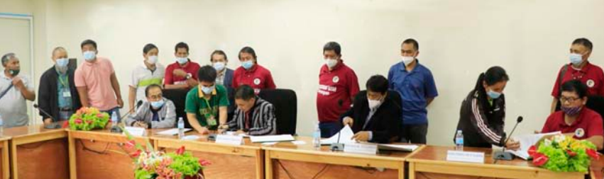
Sabangan LGU and BSU officials met on March 5, 2021 at the new R&E building as they commenced a partnership by signing a Memorandum of Agreement for the Adopt-a-Community Program.