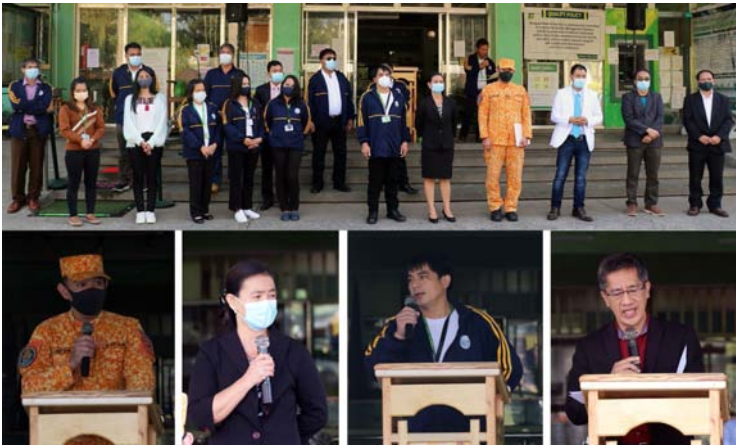
8 March 2021- Aside from being the National Women's Month, March is also declared as Fire Prevention month because of the noted increase of fire incidents happening across the country during this particular period. //MHDeRosario