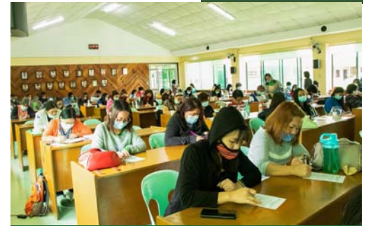
12 March 2021- The College of Teacher Education conducted a Mental Health Seminar for parents of Elementary and High School students. //PJDGadang