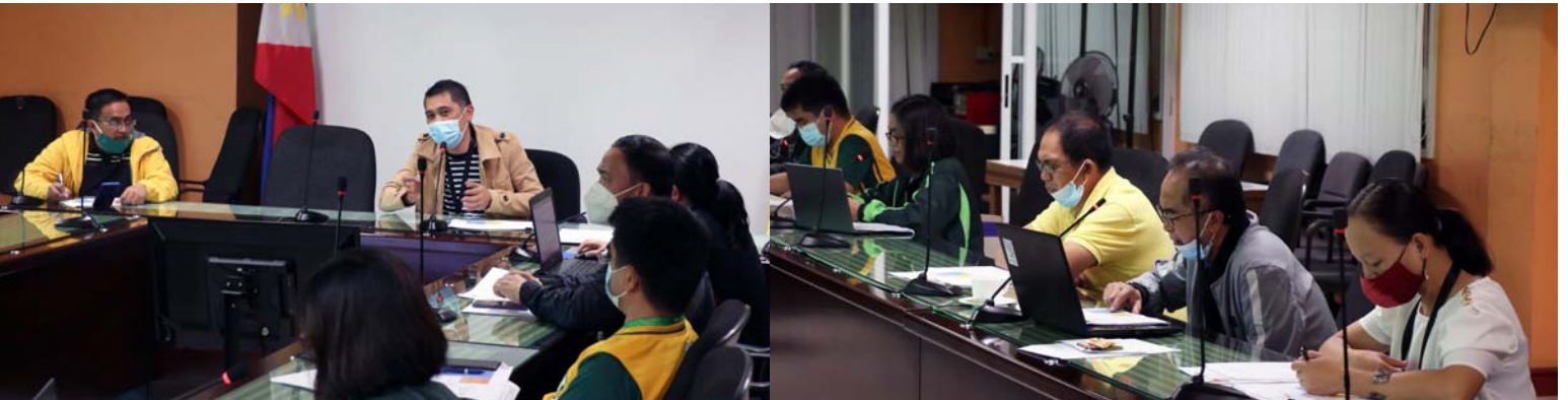
04 March 2021- The four Acting Vice-Presidents with the task force assigned on the working paper preparation of the 7 th BSU president's Vision, Mission, and Development Goals met at the AdCoR to review the final draft of the Strategic Plan 2021-2024 in line with the new VMDG to be approved by the Board of Regents.