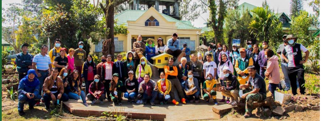
10-12 March 2021- A three-day skills training on Edible Landscaping and Containerized Gardening was spearheaded by the Gender and Development Office (BSU-GAD) with the Horticulture Research and Training Institute (HORTI). This was still in celebration of the National Women's Month. The participants landscaped the BSU Alumni Park as part of the hands-on activity. //PJDGadang