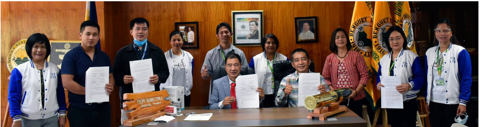
11 March 2021- The MOA between BSU College of Teacher Education (CTE) and LGU of Kapangan was renewed. CTE, upon the request of LGU Kapangan, will provide training, workshops, and other activities for the community's parents, youth, and workers based on needs assessment.