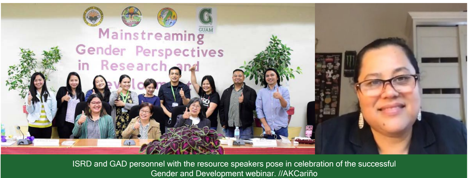
ISRD and GAD personnel with the resource speakers pose in celebration of the successful Gender and Development webinar.