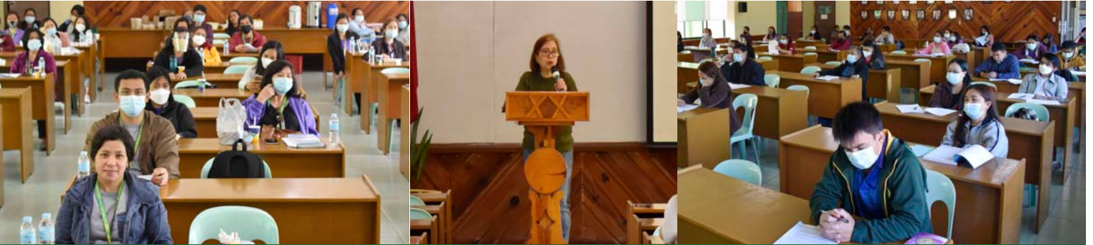
March 2-4, 2021- An orientation for the upcoming ISO 9001:2015 Internal Quality and Recertification Audit on October 2021 was facilitated by BSU-OQAA and Quality Plus Management Consulting Company.