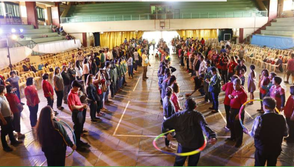
Employees enjoyed the activities such as parlor games and lantern-lighting during the University Christmas Program on December 21 at the University Gymnasium .