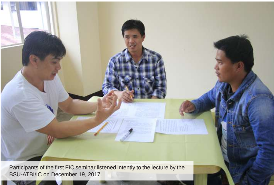
Participants of the first FIC seminar listened intently to the lecture by the BSU-ATBI/IC on December 19, 2017.