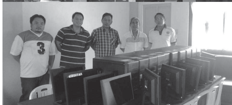
Top photo shows BSU Buguias ROTC and SSG students with their new computer units, bottom photo shows BSU officials and ICT staff with the ten computer units delivered at BSU Bokod.