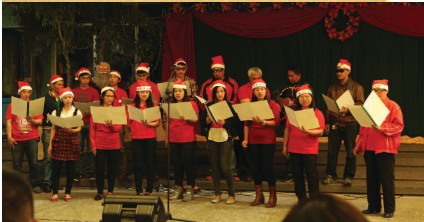
Winners of the BSU Christmas Chorale Competition held on December 23, 2016. The CTE at first place (top left photo); the CAS-IPA-ILC group at second place (top right photo) and the CA-CF-IHK at third place (bottom left photo).