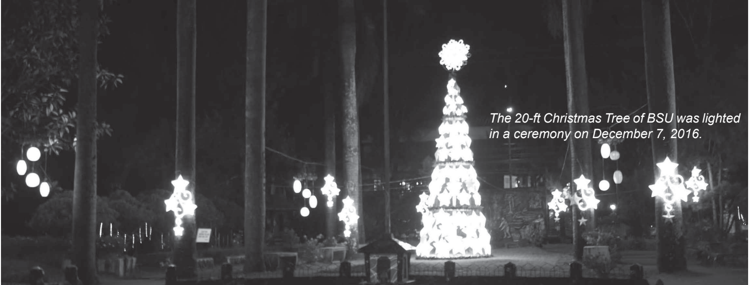
The 20-ft Christmas Tree of BSU was lighted in a ceremony on December 7, 2016.

In celebration of the Christmas and New Year, various activities were conducted in the University on the last week of December.