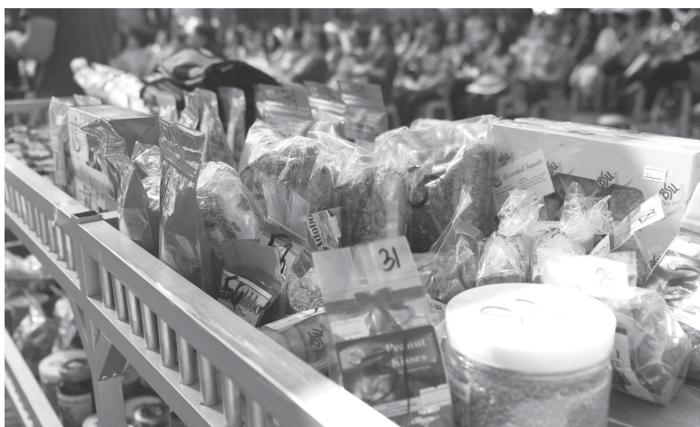
Various BSU products were given out to lucky employees courtesy of the BSUNTA, BSUGEA and FC.