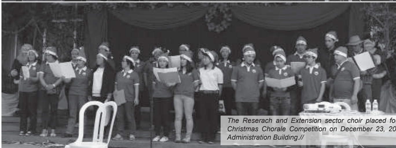
The Reserach and Extension sector choir placed fourth during the Christmas Chorale Competition on December 23, 2016 at the BSU Administration Building.//