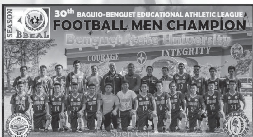
The baseball and football teams posing after winning the BBEAL championships on their respective events.//Photos courtesy of IHK and CTE