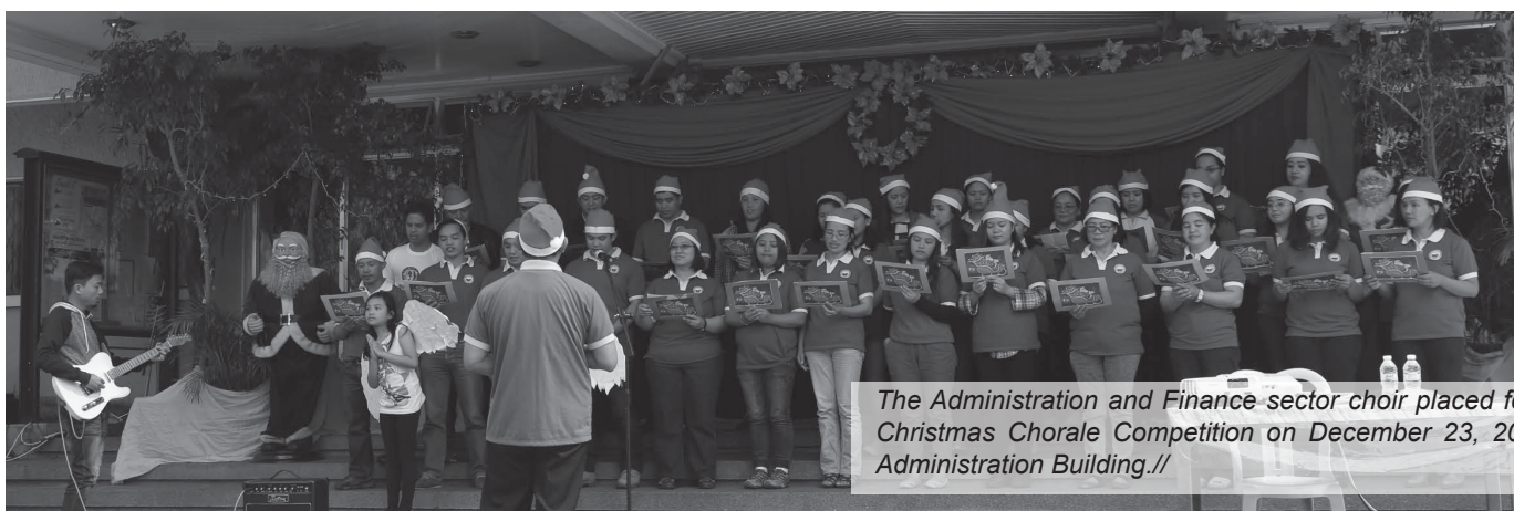
The Administration and Finance sector choir placed fourth during the Christmas Chorale Competition on December 23, 2016 at the BSU Administration Building.//