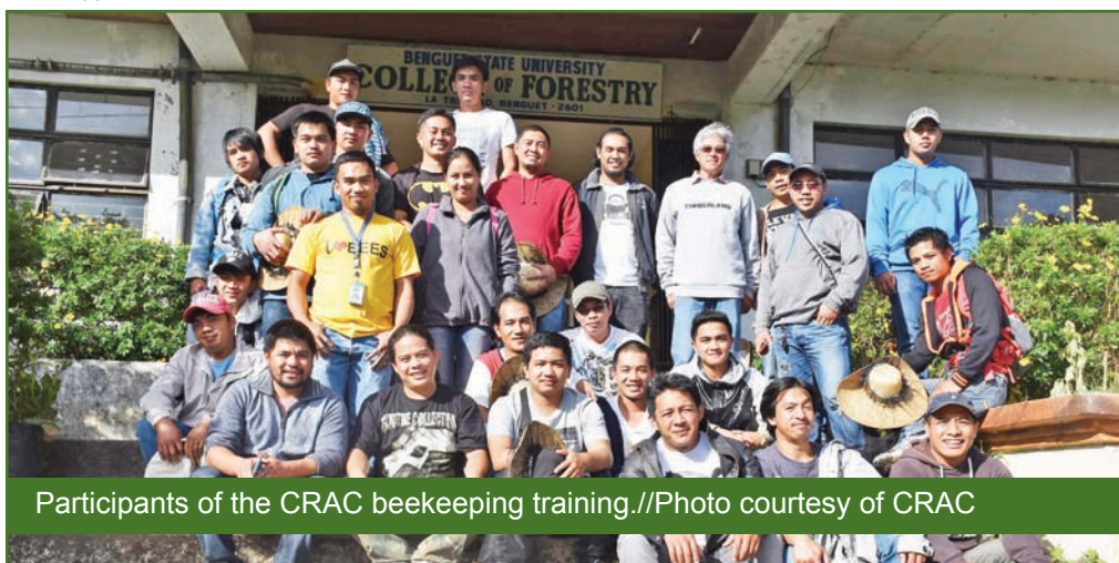
Participants of the CRAC beekeeping training.