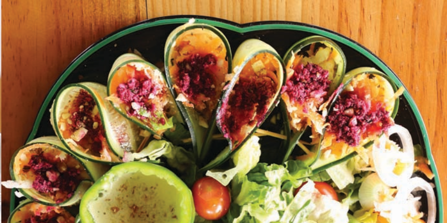
Winning entries of the Salad Making Competition during the Salad Crop and Flower Festival