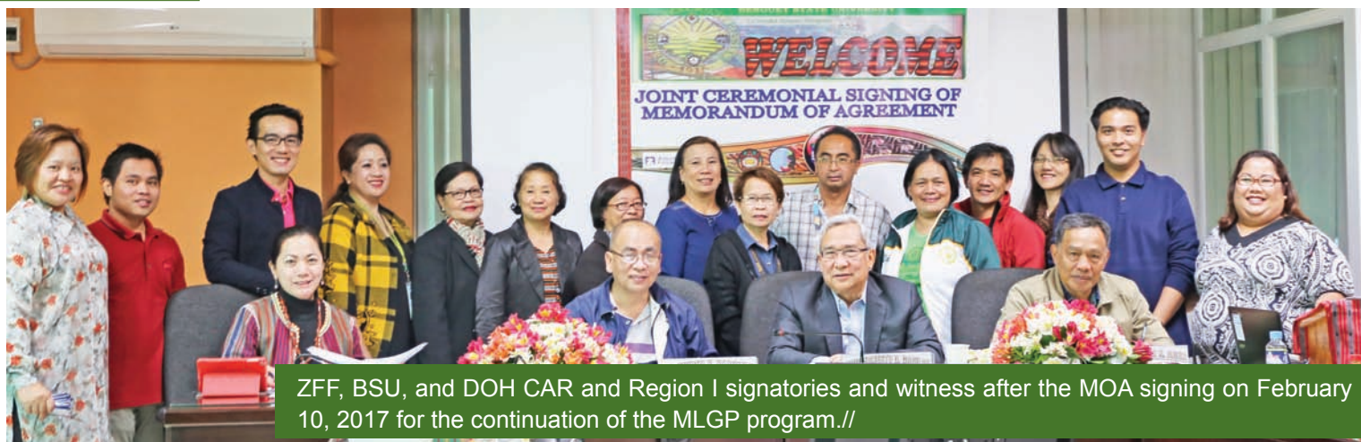
ZFF, BSU, and DOH CAR and Region I signatories and witness after the MOA signing on February 10, 2017 for the continuation of the MLGP program.//