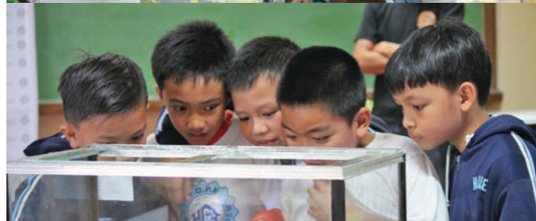
Students from nearby schools in La Trinidad were amazed by the Anatomy, Paraclinical and exotic pets exhibits during the VetMed week celebration from February 20-24, 2017.