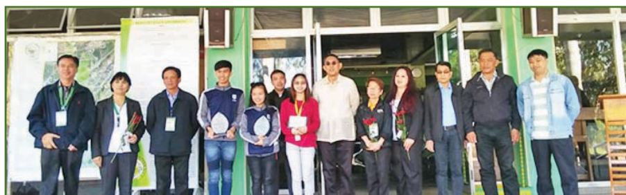
Student achievers with BSU officials during the regular Monday Flag Ceremony on February 13, 2017.