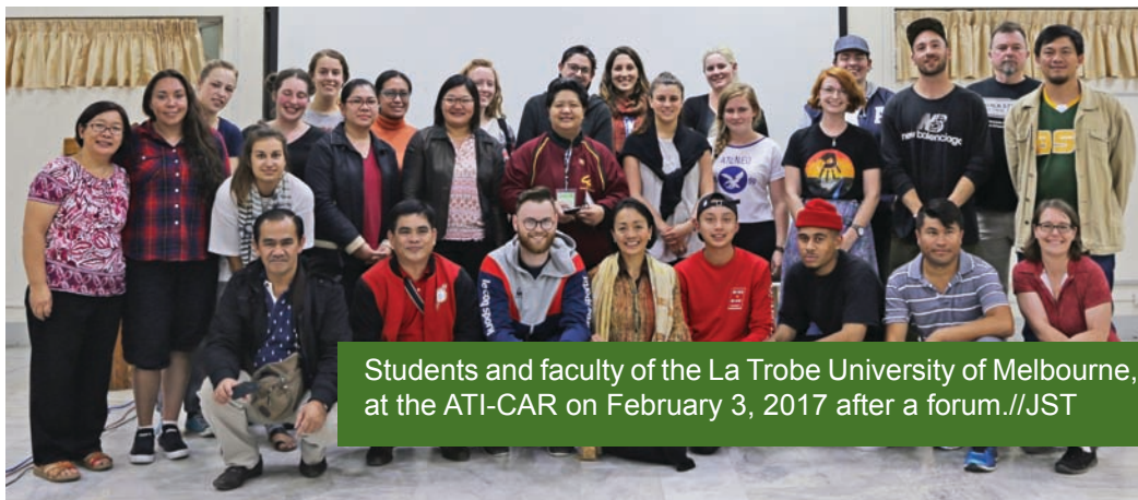
Students and faculty of the La Trobe University of Melbourne, Australia pose with BSU faculty at the ATI-CAR on February 3, 2017 after a forum.

The group was also able to witness and participate in the performance of various Cordillera dances lead by the KONTAD.//