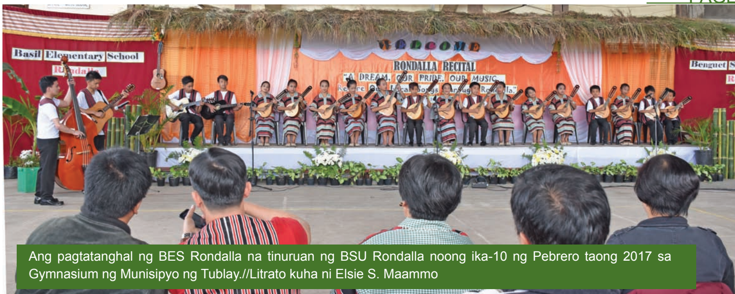
Ang pagtatanghal ng BES Rondalla na tinuruan ng BSU Rondalla noong ika-10 ng Pebrero taong 2017 sa Gymnasium ng Munisipyo ng Tublay.