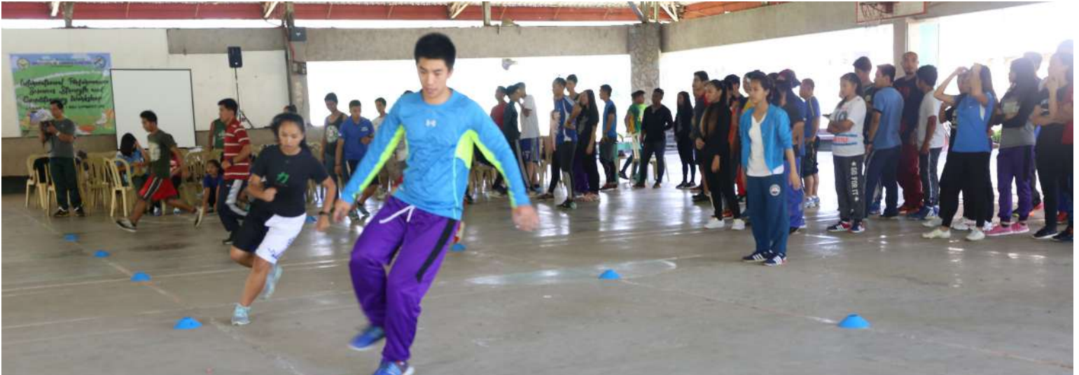
Speed and Agility Training. The third day of the International Performance Sciences, Strength, and Conditioning Workshop focused on speed, agility, and plyometric training. A group activity on conducting an overhead squat assessment was done after the morning sessions.