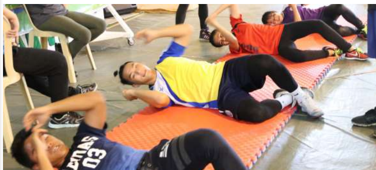
Crunch and Punch. IHK students designed a circuit of exercises as part of the International Conditioning Workshop which ran for a week from June 6-9, 2017 at the University Gymnasium. (see story on page 5)