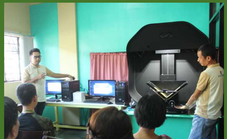
Digital Scanner. The Department of Science and Technology- Science and Technology Information Institute (DOST-STII) turned over a Digital Book Scanner (DBS) to the University on June 14, 2017. Staff of the DOST-STII lectures on how to use the high-end book scanner.