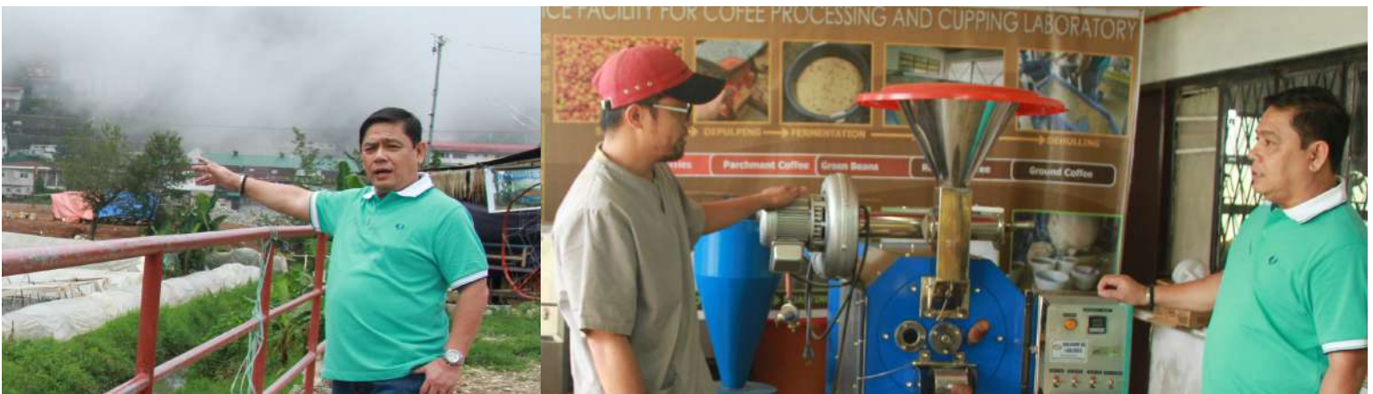
DOT Usec at BSU. Undersecretary Silvino Tejada of the Department of Tourism visited the BSU- Strawberry Fields and Institute of Highland Farming Systems and Agroforestry on June 29, 2017 in search of more products to promote agro-tourism.