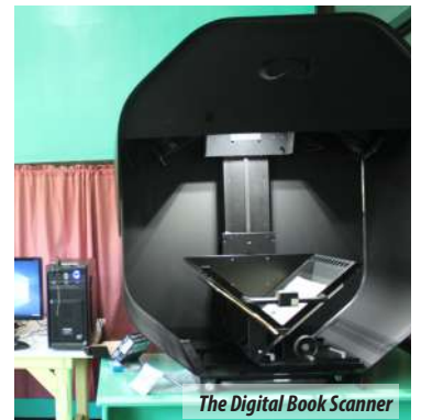
The Digital Book Scanner