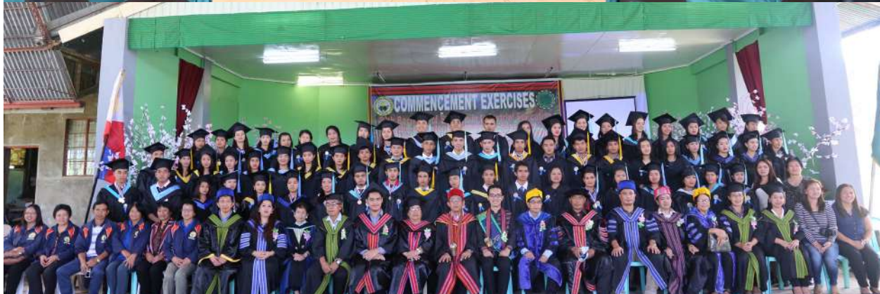
Centennial Graduates. The 2017 graduates of Benguet State University Buguias Campus (top photo) and Bokod Campus (bottom photo) pose with University officials after the commencement programs.