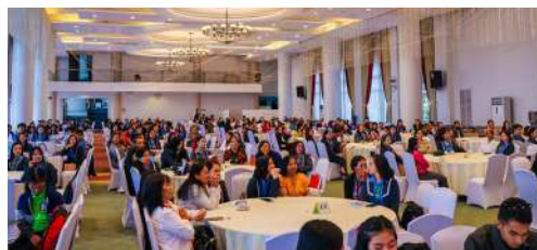
CTE holds first pinning ceremony for pre-service teachers