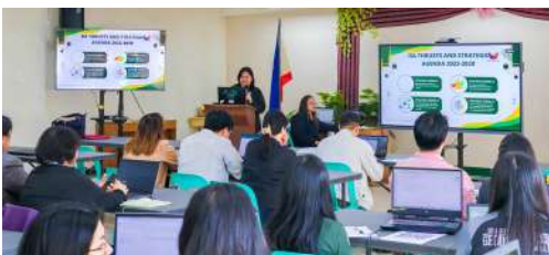
BSU hosts DA – Bureau of Agricultural Research mentoring workshop