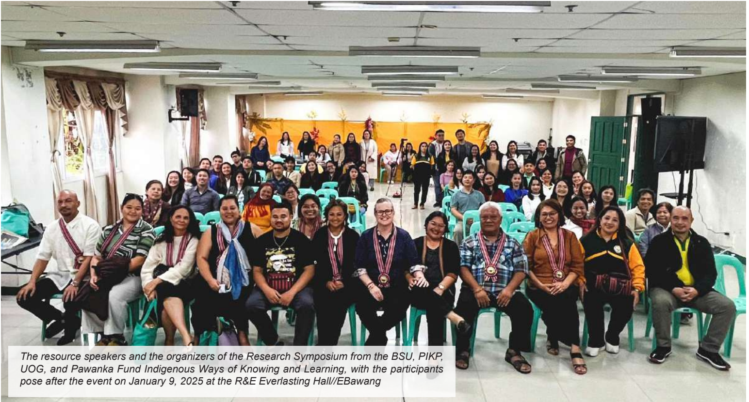
The resource speakers and the organizers of the Research Symposium from the BSU, PIKP, UOG, and Pawanka Fund Indigenous Ways of Knowing and Learning, with the participants pose after the event on January 9, 2025 at the R&E Everlasting Hall/EBawang

Benguet State University's Institute of Social Research and Development (ISRD), Gender and Development (GAD) Office, International Relations Office (IRO), and the College of Social Sciences (CSS) hosted a research symposium showcasing studies on the indigenous healing practices in the Cordillera Administrative Region and the Pacific Islands. This was held on January 9, 2025 at the Everlasting Hall of the Research and Extension Bldg. in collaboration with the Partners of Indigenous Knowledge-Philippines (PIKP), University of Guam: Unibetsedät Guåhan (UOG), and Pawanka Fund Indigenous Ways of Knowing and Learning.