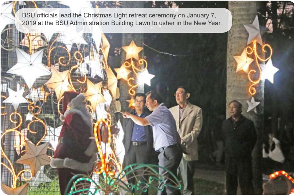
BSU officials lead the Christmas Light retreat ceremony on January 7, 2019 at the BSU Administration Building Lawn to usher in the New Year.