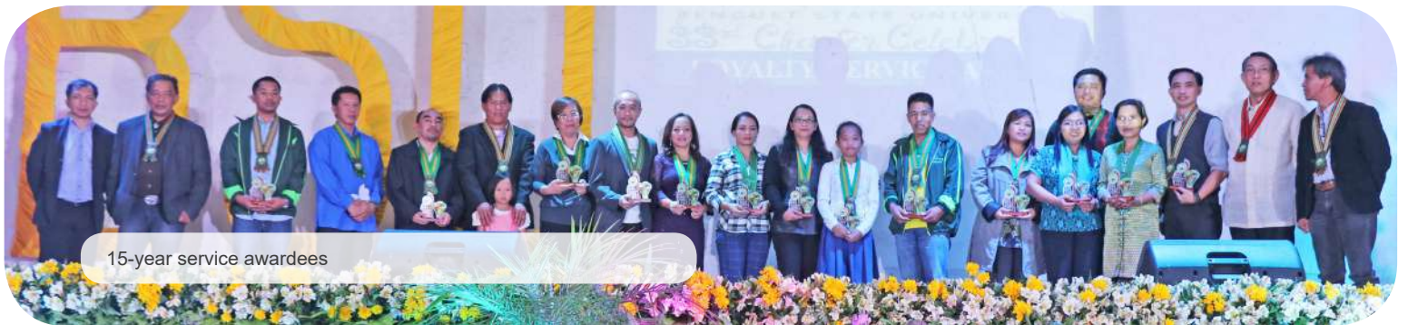
15-year service awardees