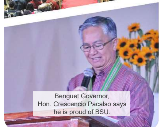
Benguet Governor, Hon. Crescencio Pacalso says he is proud of BSU.