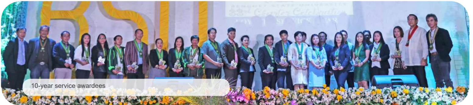
10-year service awardees