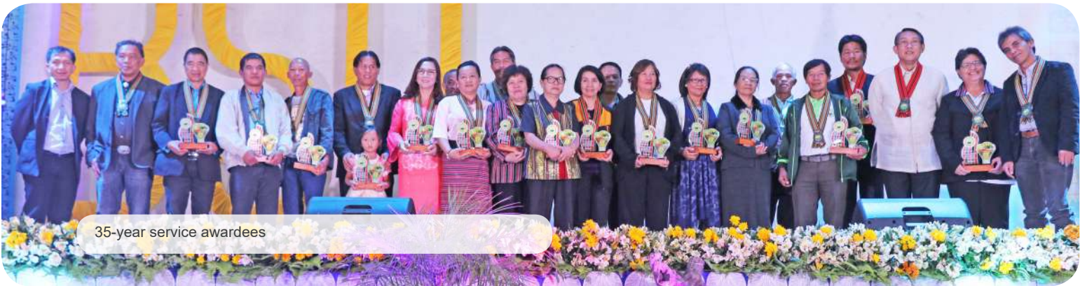
35-year service awardees