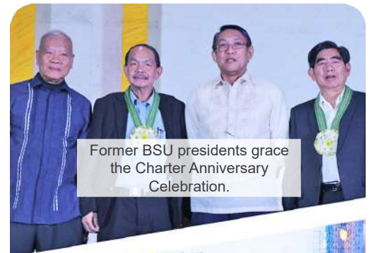
Former BSU presidents grace the Charter Anniversary Celebration.