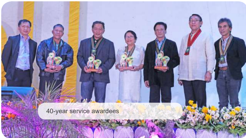
40-year service awardees