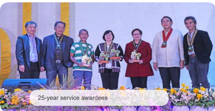
25-year service awardees