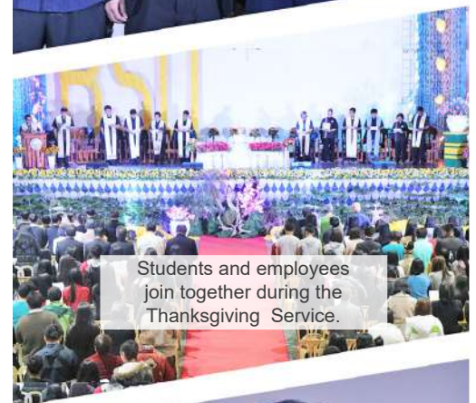
Students and employees join together during the Thanksgiving Service.