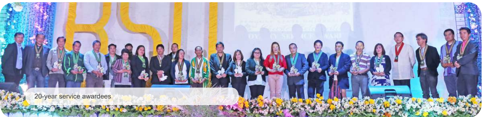
20-year service awardees