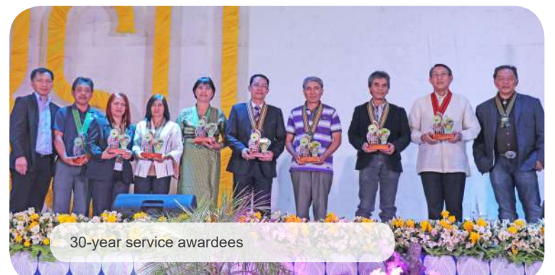
30-year service awardees