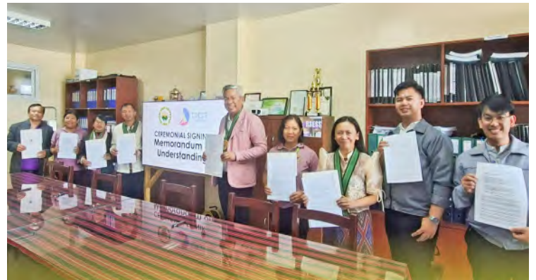
BSU and DICT-CAR officials pose after signing a Memorandum of Understanding to strengthen collaboration in ICT programs and digital skills development