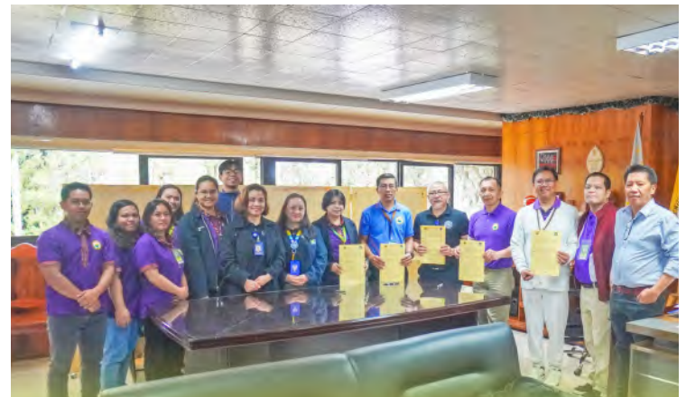
BSU and Pag-IBIG Fund officials after signing a Memorandum of Agreement establishing a savings program for job order and contract of service workers