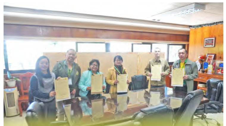
BSU and Siloam College officials pose after signing a MOA for a five-year partnership on the implementation of the National Service Training Program (NSTP)