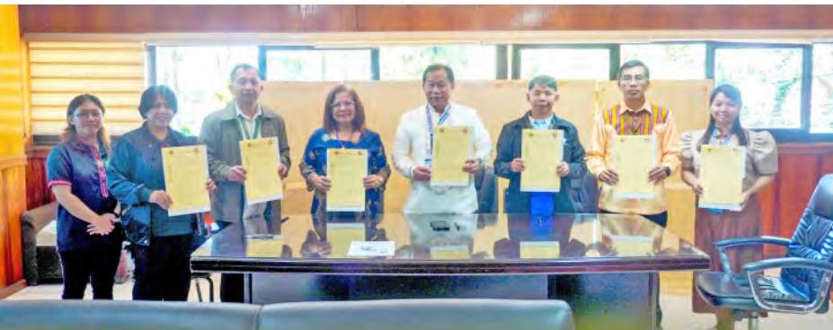
BSU and SSS officials pose holding the signed MOA formalizing their partnership to enhance social security benefits and services for university personnel and stakeholders