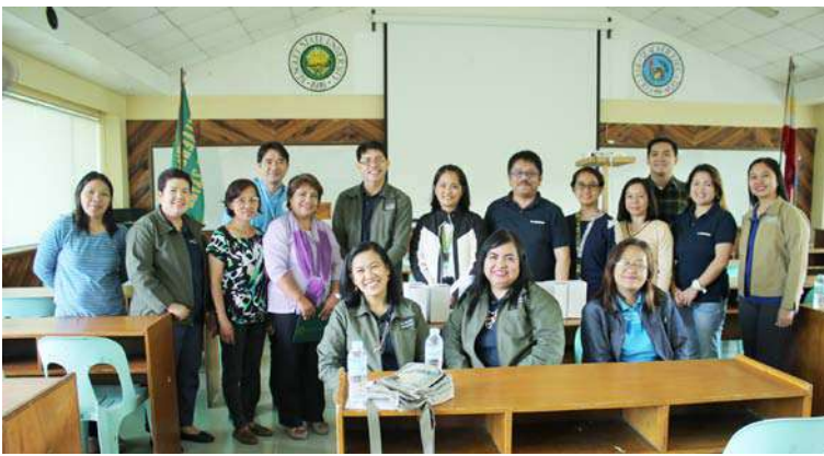
DLSU meets BSU-CTE officials. Visitors from De La Salle University, Dasmariñas Cavite meet with College of Teacher Education officials during their benchmarking activity at Benguet State University on July 25, 2017. This is for the DLSU faculty to gather best practices in terms of instruction, student teaching program, community service, research, accreditation and others of the College of Teacher Education. CTE is Center of Excellence.