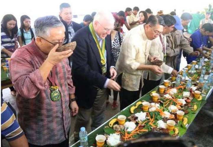
FPAAA and BSU officials opened the exhibits of the three-day FPAAA conference on July 20, 2017 at the BSU Gymnasium.