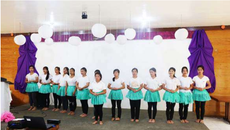
ESGP-PA Scholars performing their winning piece in the speech choir competition during the closing program for the EAP-TC III of the International Language Center//DSEmok