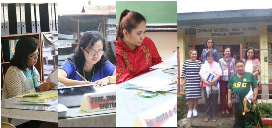
AACCUP accreditors at work and during their field visit at Kibungan National High School, one of BSU's extension sites.

Six degree programs of the University were revisited by the Accrediting Agency of Chartered Colleges and Universities in the Philippines (AACCUP), Inc. Only Area VII (Library) of the degree programs PhD Horticulture, PhD Rural Development, MS Soil Science, MS Rural Development and BS in Nutrition and Dietetics were evaluated while the degree BS Applied Statistics was reviewed in all areas.