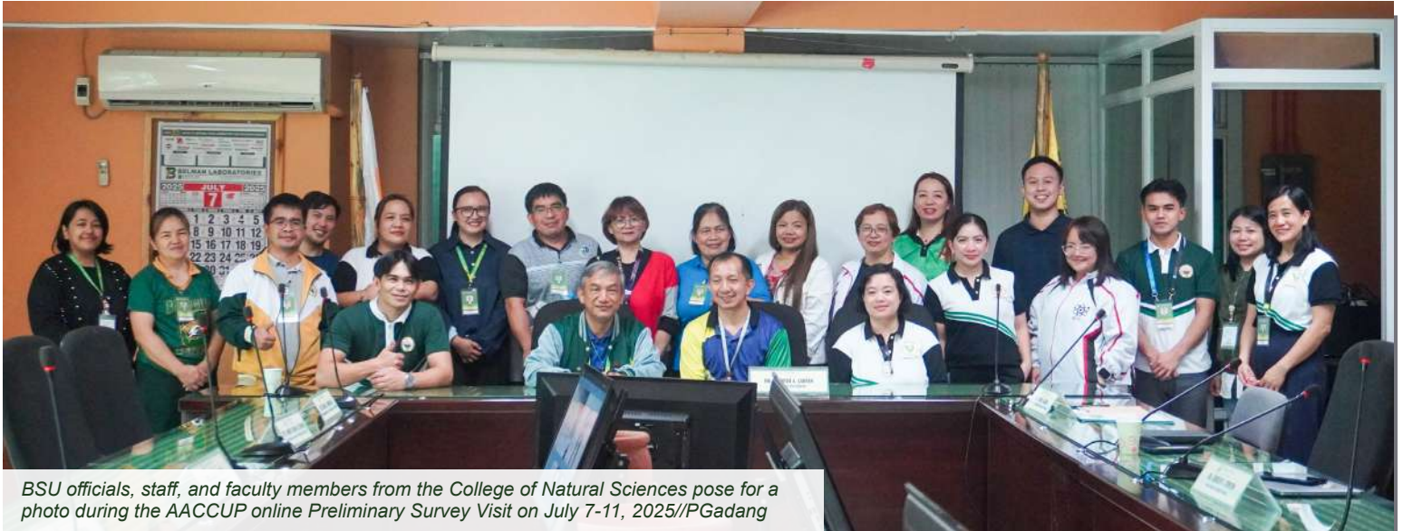
BSU officials, staff, and faculty members from the College of Natural Sciences pose for a photo during the AACCUP online Preliminary Survey Visit on July 7-11, 2025

The Benguet State University - College of Natural Sciences (CNS) submitted two undergraduate programs for evaluation by the Accrediting Agency of Chartered Colleges and Universities in the Philippines (AACCUP) during the online Preliminary Survey Visit on July 7-11, 2025.