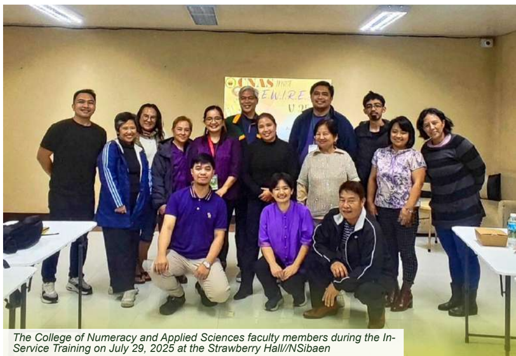
The College of Numeracy and Applied Sciences faculty members during the In-Service Training on July 29, 2025 at the Strawberry Hall/NSibaen

In the afternoon session, faculty members from the Statistics