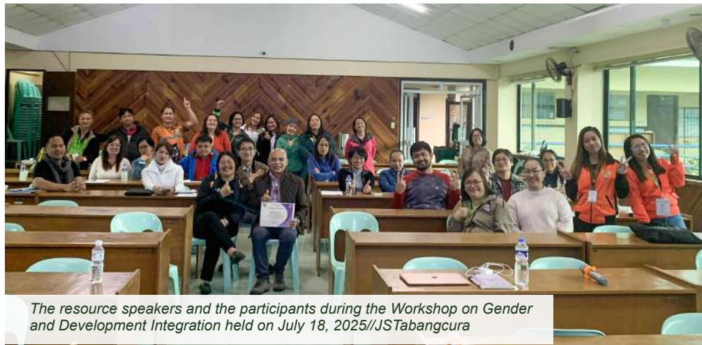
The resource speakers and the participants during the Workshop on Gender and Development Integration held on July 18, 2025

Prestousa highlighted SLU's best practices in promoting gender sensitivity and inclusivity, including initiatives by the GAD Committee, use of sex-disaggregated data, educational posters across buildings,