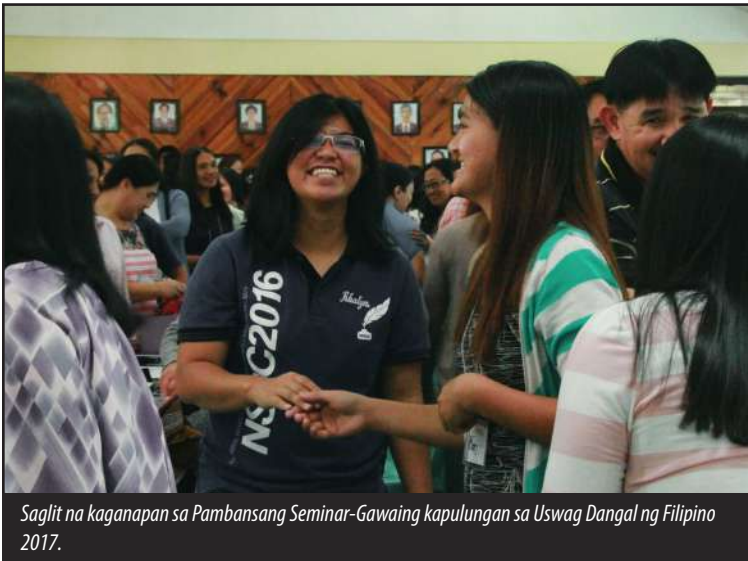
Saglit na kaganapan sa Pambansang Seminar-Gawaing kapulungan sa Uswag Dangkal ng Filipino 2017.

The Editorial Board apologizes for any inconvenience these errors have brought.