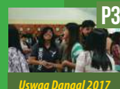
Uswag Dangkal 2017