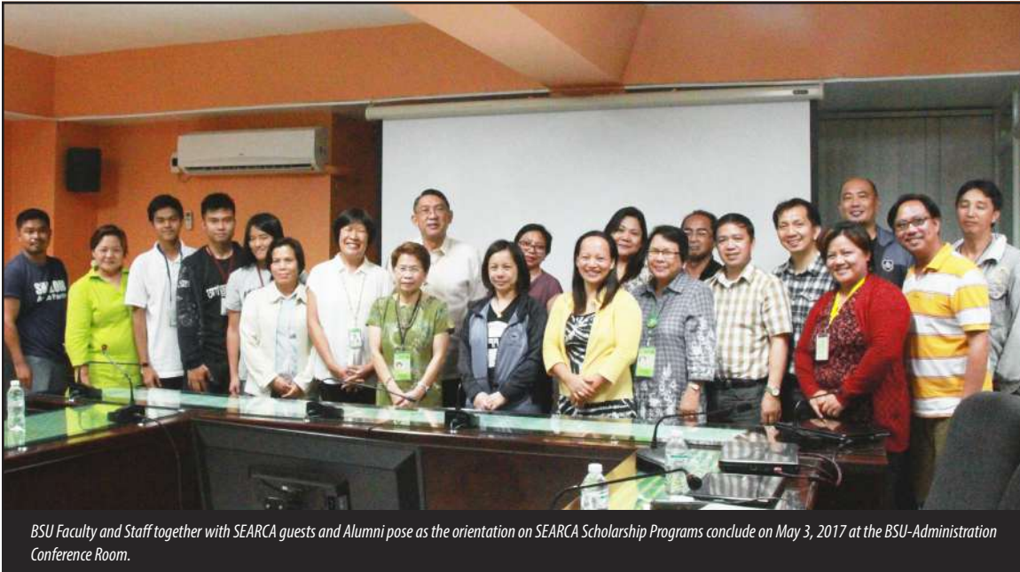
BSU Faculty and Staff together with SEARCA guests and Alumni pose as the orientation on SEARCA Scholarship Programs conclude on May 3, 2017 at the BSU-Administration Conference Room.