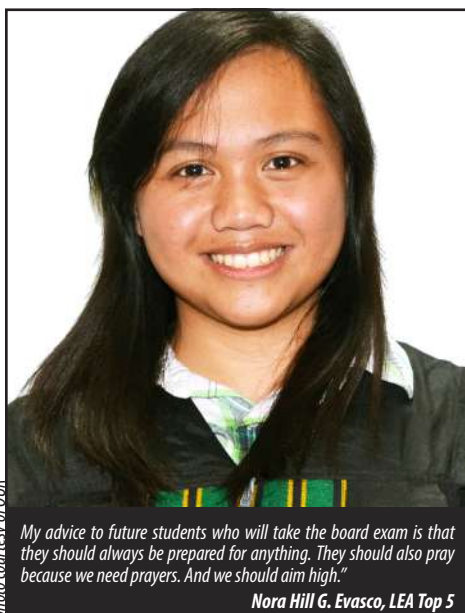
My advice to future students who will take the board exam is that they should always be prepared for anything. They should also pray because we need prayers. And we should aim high.