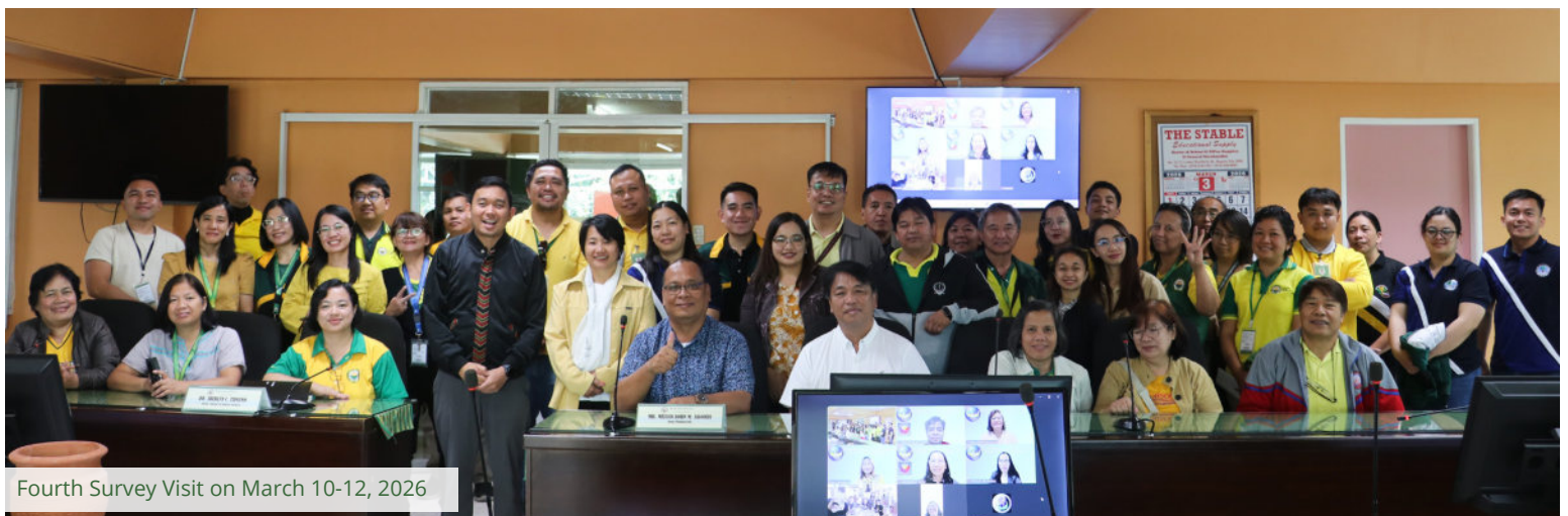
Fourth Survey Visit on March 10-12, 2026

The survey visits included document verification, interviews, and virtual campus tours. 🗺️📷 E. Bawayan, P.J. Gadang