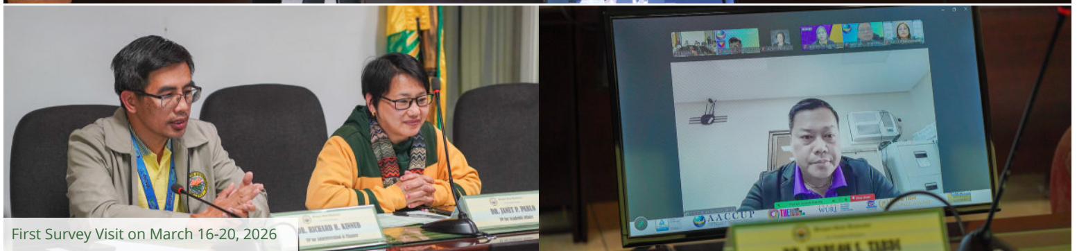
First Survey Visit on March 16-20, 2026