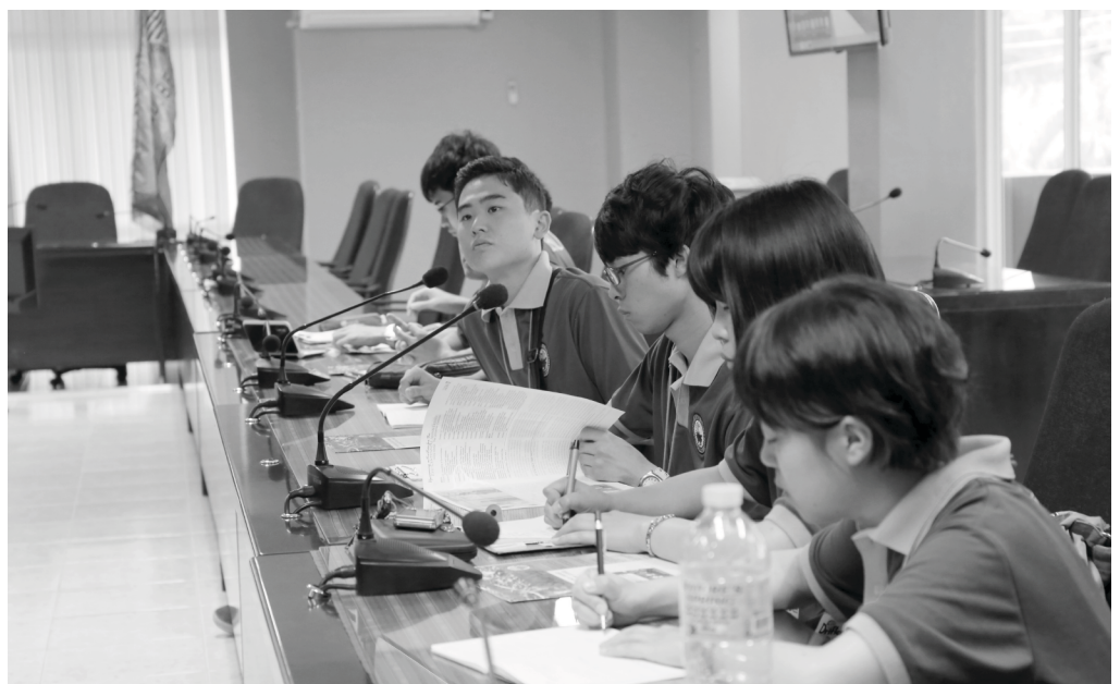
A group of 13 students and academic staff of the Obihiro University of Agriculture and Veterinary Medicine from Japan were in the University on September 19, 2016. The students are with the International Cooperation Studies Program of their university. The purpose of their visit was to study and observe farming systems in BSU.// JST