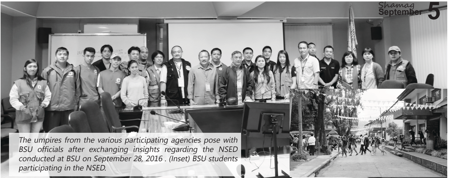
The umpires from the various participating agencies pose with BSU officials after exchanging insights regarding the NSED conducted at BSU on September 28, 2016. (Inset) BSU students participating in the NSED.