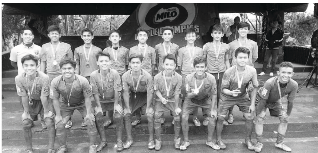
The BSU Secondary Laboratory School Football Team won the championship during the Milo Little Olympics 2016 North and Central Luzon Leg held on September 2-4, 2016 in Baguio City.// Photo courtesy of the BSU-Fc facebook page

The program was attended by the BRSRC members, LGU officials and NGOs.