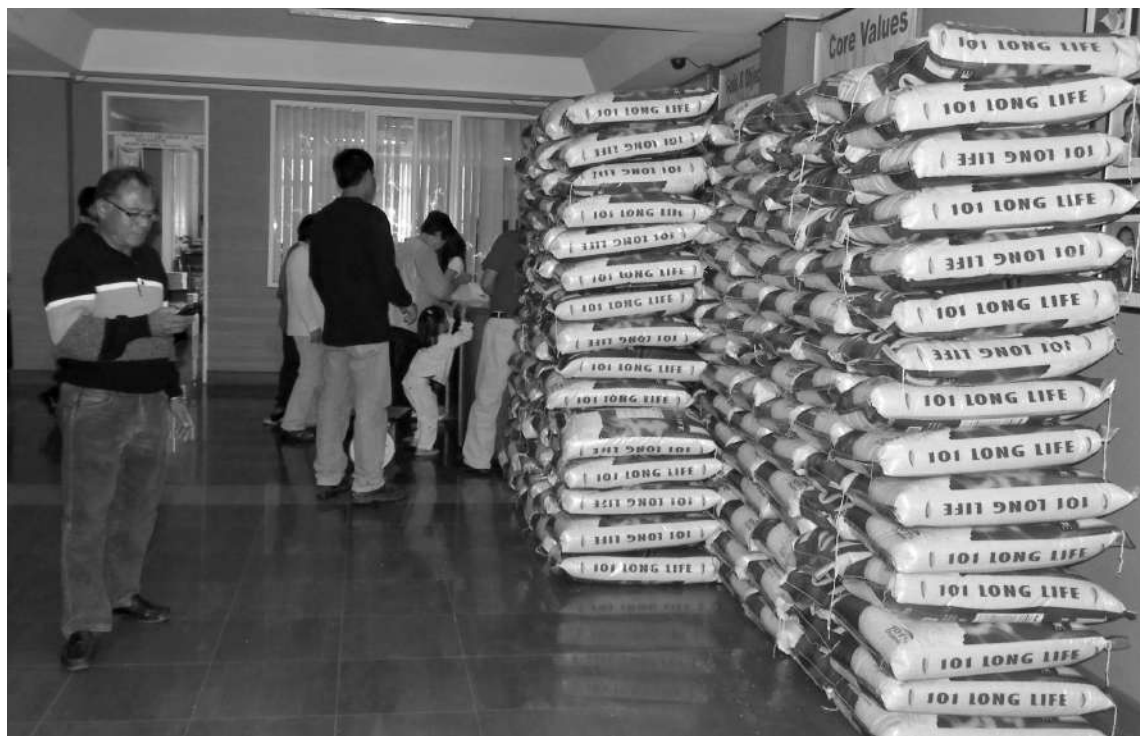
Officials of the BSUNTA and staff of the Supplies Office started distributing rice incentives to BSU employees on August 16 at the Administration Bldg. Lobby.

Permanent, contractual, and job order employees of the University are the grantees of this annual incentive. //