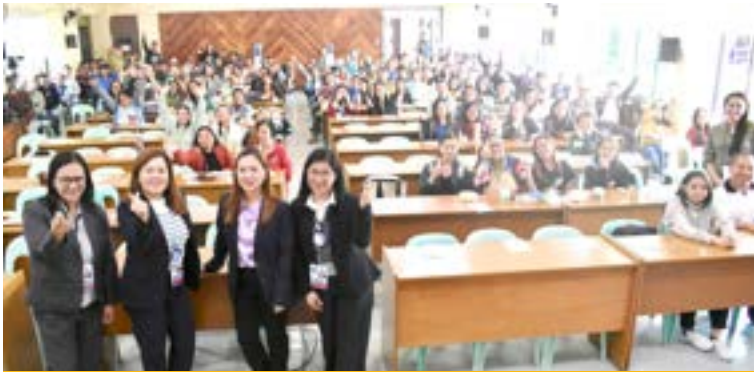
Speakers from GSIS during the seminar on salary, benefits and obligations organized by the CBOO on February 28-29, 2024

The speakers also shared updates on using the GSIS Touch Mobile Application in the afternoon session. The GSIS representatives assisted the participants with the mobile app. A consultation session was also held.