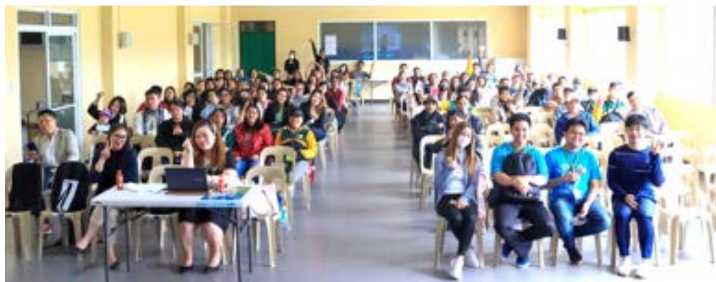
Participants and speakers of the seminar organized by the BSU-GAD Office on February 26, 2024 as part of their advocacy against gender-based violence//PGadang

This was followed by an open forum where students' seeking clarifications regarding the Cordillera autonomy campaign, its relevance and implications were entertained. The activity was highlighted with the signing of the manifesto in support of the Cordillera autonomy and a mock plebiscite.//EBawayan