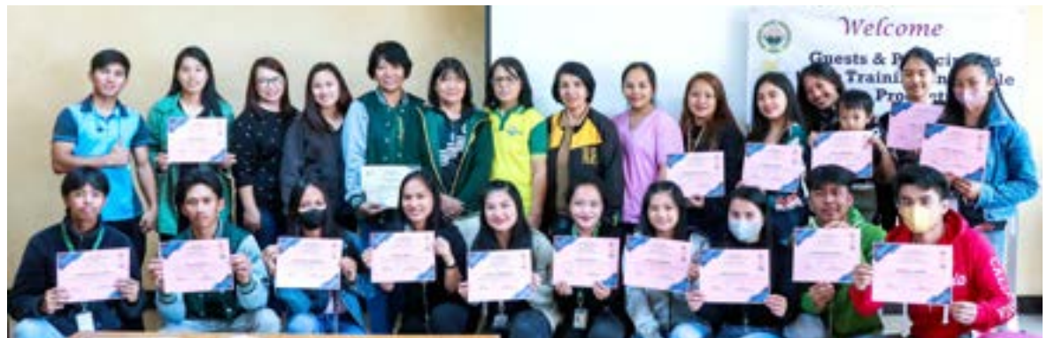
Participants and speakers of the Purple Yam Production Training organized by the NPRCRTC on January 30-31, 2024. //CANapiloy

BSU personnel along with several agriculture students majoring in agronomy attended the said event. // EMBawayan, CANapiloy