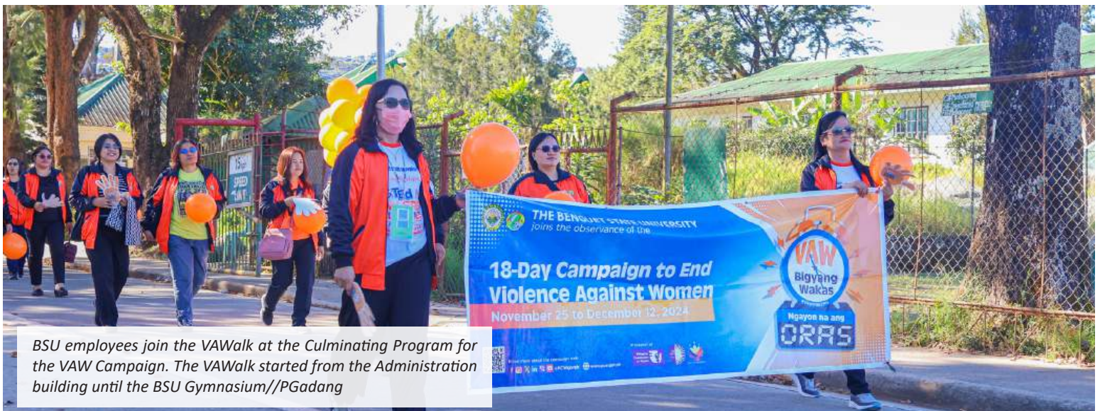
BSU employees join the VAWalk at the Culminating Program for the VAW Campaign. The VAWalk started from the Administration building until the BSU Gymnasium//PGadang